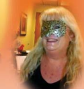
Bonny Cat Woman