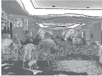
(left) Members gather for the UG-SOA International 2008 Fall Seminar Reception. Our next seminar will also be held in Denver, CO in September 2009

Thank you to all of the members who attended our most recent training seminar in Denver, CO. As usual, we had a great turn out and we look forward to seeing you at the next seminar to be held in Denver, Colorado in September 2009.