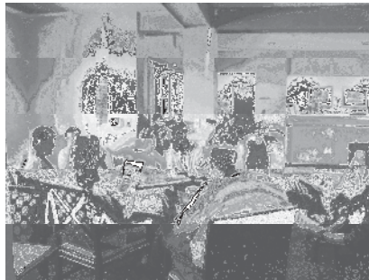
(above) Members preparing for a Mock Arbitration .