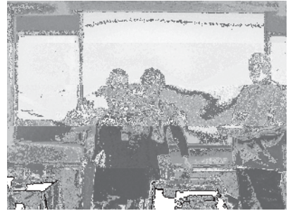
(right) Members gather for the UG-SOA International 2008 Fall Seminar Reception. Our next seminar will also be held in Denver, CO in September 2009